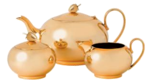
Ladies Advent Tea Friday, December 1