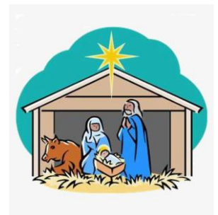
Christmas Monday, December 25