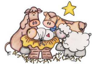
Living Nativity Saturday, December 16